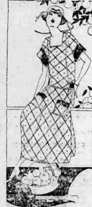
Even a morning frock should show some conformity to style. This one has the long waist, a slight fullness over the hips to give a long line front and back, and ties in the back with a sash.