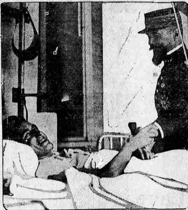
General Henri J. E. Gouraud, "Lion of the Argonne" now visiting this country, pays his respects to his comrades at the Walter Reed Hospital, Washington, D. C.