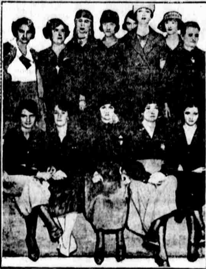
Clad in the "camici nera"—the black-shirts of the Fascisti—women have flocked to the support of Mussolini's government. The picture above shows one of the first meetings of the women's auxiliary.