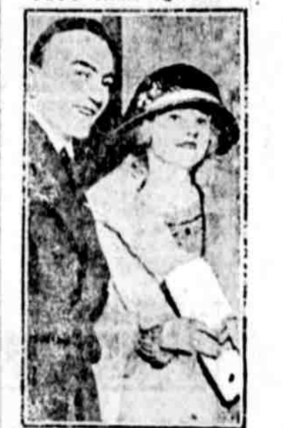
The brave deserves the fair. Eddie Rickenbacker, ace of American aviators, is shown here with his wife on their return from Europe.