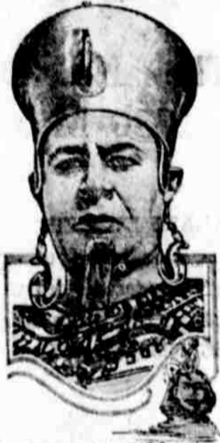
EMIL JENNINGS in the PARAMOUNT PICTURE "THE LOVES OF PHAROAH"