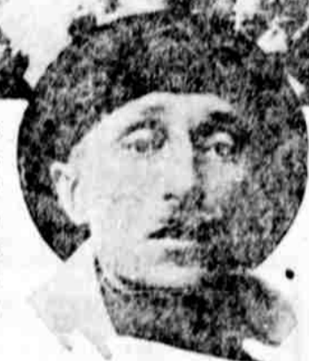
Kemalists, marching at its head. Enthusiastic crowds greet the conquerors of the Greeks and, assure the Nationalists that they will have popular support against the allies. Inset shows Refet Pasha.