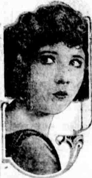
Betty Compson in the Paramount Picture "The Bonded Woman"