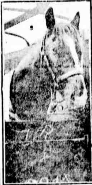
Molly, heroic British war horse, wounded three in the World War, today is on a transport bound for the Near East, where she'll take part in military activity on the British-Turkish front.

7777—See the cat tomorrow after he has made his escape from the bag. The ad on Page Two in tomorrow's paper will show what a wise cat will do. Get ready for Saturday and that free dinner—7777.