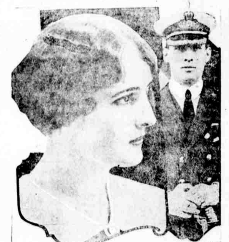
QUEEN ELIZABETH AND KING GEORGE OF GREECE