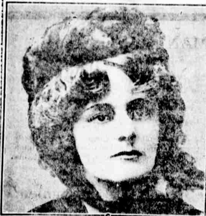
Maude Gonna MacBride, Irish feminist leader, is referred to by Sinn Feiners as their Joan of Arc. She recently was expelled from the gallery of the Irish Parliament for heckling speakers of the pro-treaty faction.