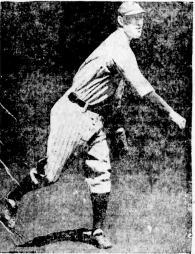
JOE BUSH, YANKS