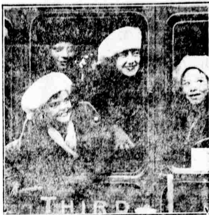
Orphans from the Barnardo Homes, England, smile happily as they leave by railway for a port whence they'll be taken to Canada for adoption. They're confident happy homes await them there.