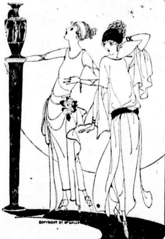
If you have a fancy for the classical, you may choose your winter costume according to the mode prevailing in the year 100 B. C. Side drapes, full blouse and straight necklines all are as popular now as then.

Paris—The idea of an embroidered initial or monogram or even the wearer's name set on the blouse or sweater may indicate, as has been asserted more than once, a child-like mind. But if this is so the number of child-like minds is increasing rapidly. Today the fashionable location of such an embroidered initial or monogram—the name being no longer in favor—is not the front nor even the shoulder of the blouse. It is high on the left sleeve.