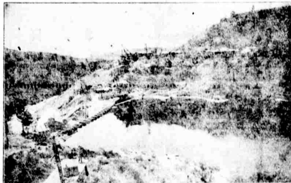
Construction at Copco Plant

See our Preferred Stock Exhibit at the Jackson County Fair, Medford, Oregon, September 13, 14, 15, 16