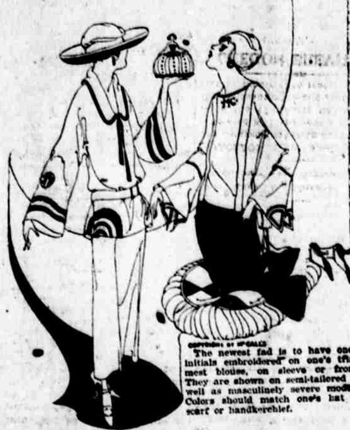
The newest fad is to have one's initials embroidered on one's trimmest blouse, on sleeve or front. They are shown on semi-tailored as well as masculinely severe frocks. Colors should match one's hat or scarf or handkerchief.