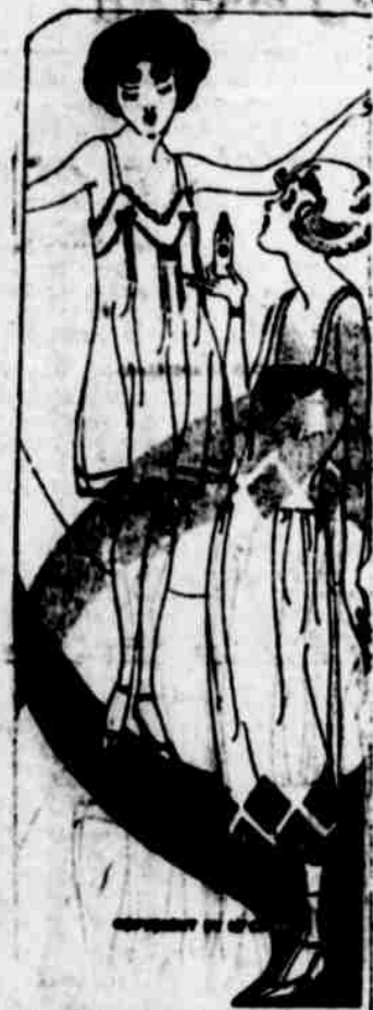
Newest material for fine lingerie is crepe-back satin. Pussy willow silk, sheer chiffon voile and crepe de chine are other favorites. Deeper colors are expected to be favored—coral, deep orchid, gold-on-silks follow. Fresh color in popularity. Tailored styles with little trimmings are preferred.

NEW YORK—Some of the autumn blouses on display today concentrate their decoration low at the center of the throat. There will be, for example a gauzy blouse trimmed with a single bright line of embroidery around the neck and perhaps around the cuffs. This absence of decoration is, however, atoned for by the heavily worked motif of any embroidery which splashes in a big lozenge half way up the front and out the top of the skirt.