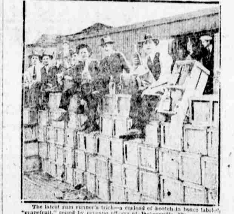
The latest rum runner's trick—a carload of bottles in boxes labeled "grapefruit," seized by revenue officers at Jacksonville, Fla.