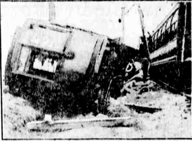
Several score persons were injured when a three-car electric train of the Niagara Falls "high speed" line was wrecked following a dynamite explosion near Buffalo, N. Y. Passengers were tourists from Philadelphia, Baltimore and New England points. Four men were seen at the scene of the explosion a few minutes before it occurred.