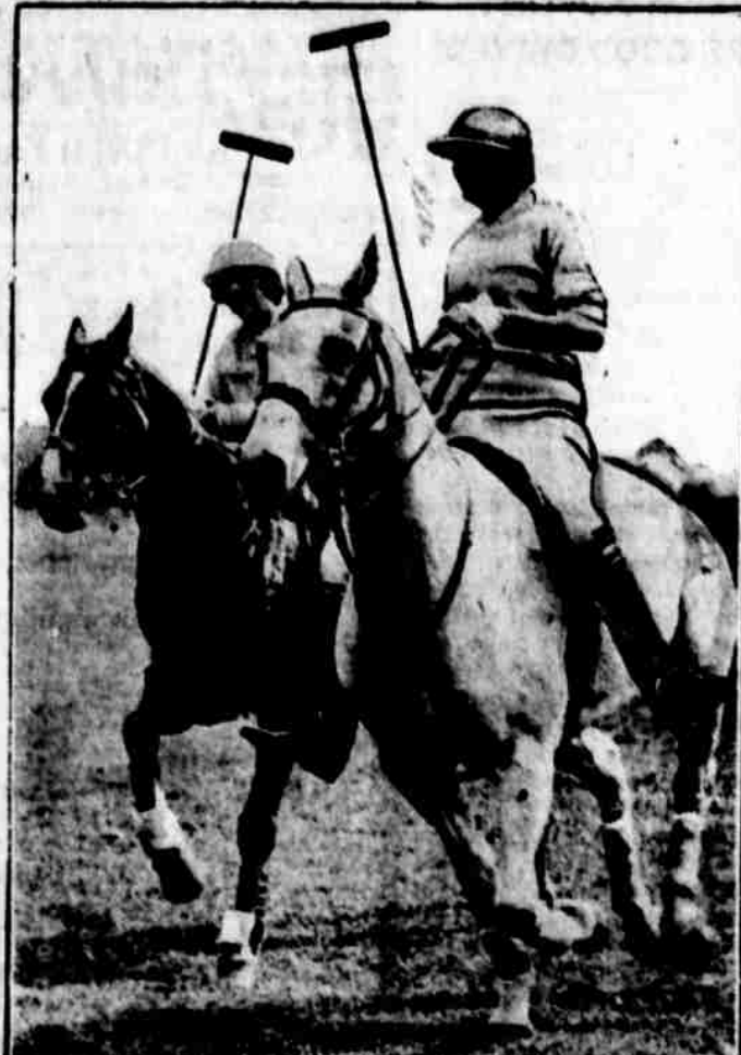
Polo and football are two sports that men have long considered too strenuous for women, but look at this picture. Women at Buntingby, England, not only play polo matches among themselves, but play against the men.