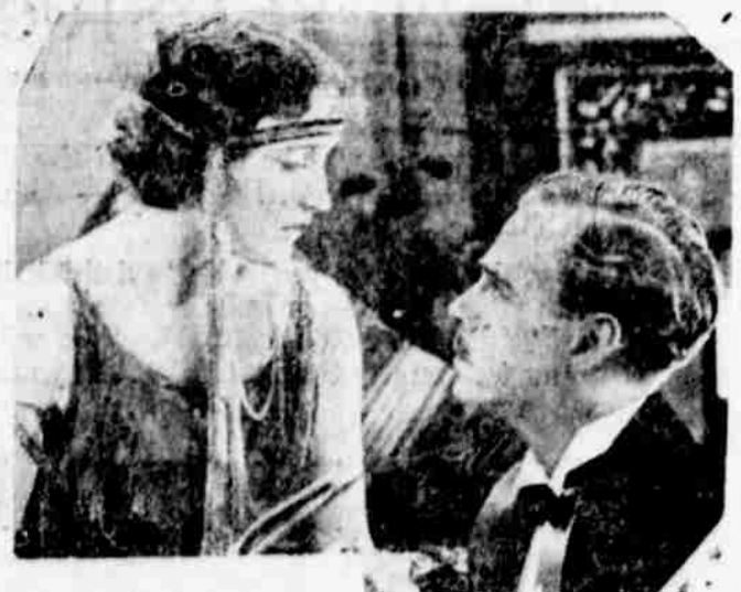
A scene in "Fair and Warmer" which will be shown at the Star theatre Monday by the Hildebrand dramatic company.

Dad: "Tommy, if you'll saw some wood I'll tell you what I'll do." Bert: "What's that, dad?" Dad: "I'll let you have the saw-dust to play circus with."