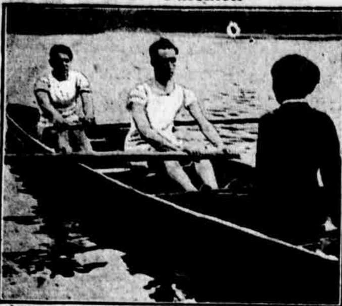
These oarsmen, although blind, participated in the St. Dunstan's Regatta at Putney, England. They were coached by a woman.

Both fighters appeared more or less drawn and nervous and Leonard appeared a trifle more drawn than Tendler. Leonard leaned over the ropes and jokingly remarked to a friend at the ringside that the bout would be over in a few minutes. Tendler sat quietly in his corner with downcast eyes and listened attentively to the instructions of his seconds.