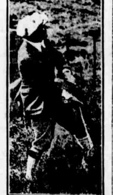
British golf experts say the cheerfulness of Jock Hutchison, British open champion, is worth two strokes a round to him. Here Jock smiles as he gets out of the rough in the Thousand Guinea tournament in Scotland.

Last year 41,392 automobiles were exported from the United States. Latin-American countries took nearly one-third of this number; British North America 15.4 per cent; Asiatic countries, 14.5; Europe 13.1; Oceania, 11.1; non-contiguous territory of the United States, 8.8; Africa 3.7.