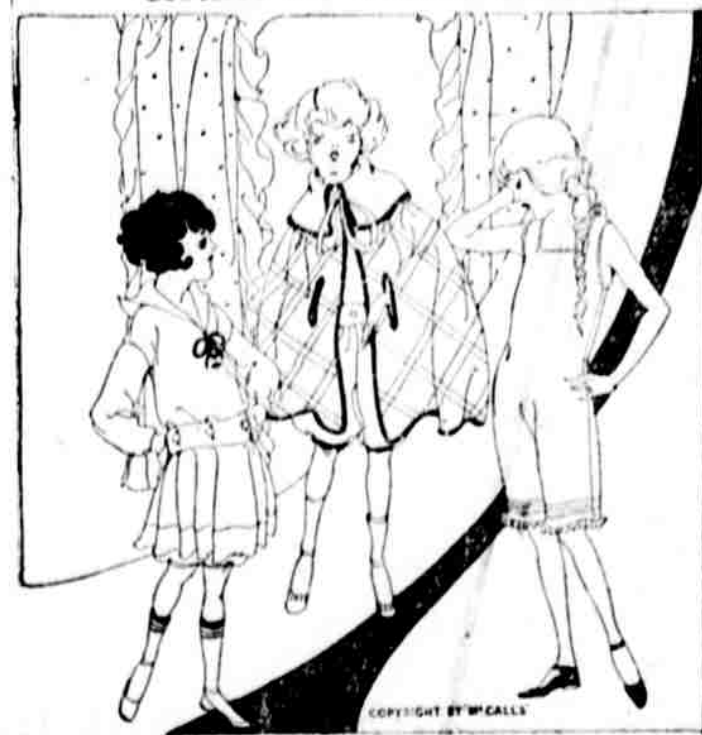
This durable but dashing cape for school girls may be had in heavy woolen plaid for cold weather or lighter misterial for early fail. The middy is of bloomered variety with detachable skirt. The one-piece undersuit is typical of the newest underwebr for girls.

PARIS, The Spanish comb has had many placings and replacings since its recent appearance as an adjunct to the colffure. At first it was thrust into the side of the highly plled hair. Then it was thrust straight up in back. But always it found use as an ornament for a high coiffure, whereas now it is thrust jointily into a cofffure whose salient feature is a roll of hair low on the back of the neck. In this position the Spanish comb is threat rakishly to one side, but outward rather than upward.