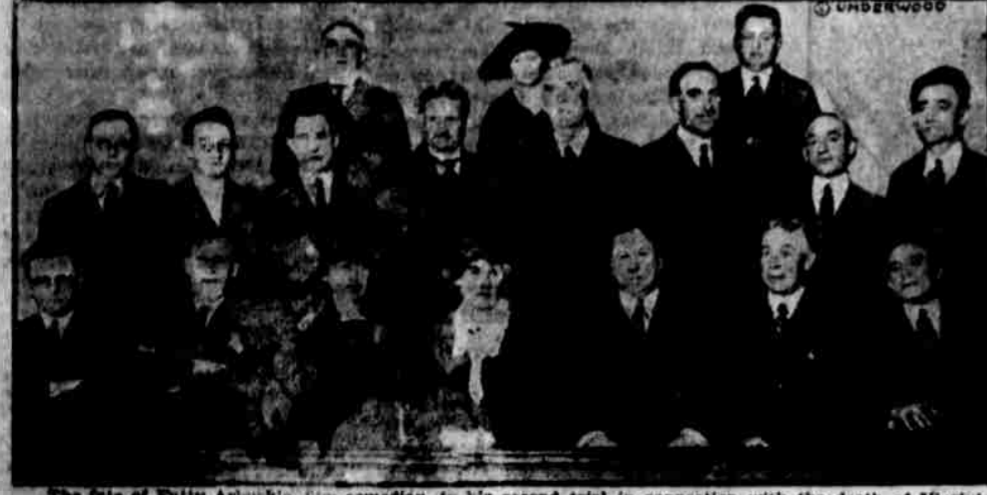
The fate of Fatty Arbuckle, film comedian, in his second trial in connection with the death of Virginia Rappe depends on the above jurors. Three of them are women. His first trial following the death of the girl in his room at a San Francisco hotel ended in a disagreement.