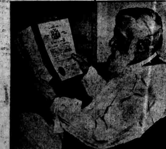
Dr. Adolf Lorenz looking at the state and city licenses which for nearly a year he has been waiting to receive. Issuance of the license to the noted Viennese surgeon was delayed some time.