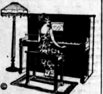
Beautiful new sample Player-piano. Greatly reduced, and terms within reason during two weeks only.—EARL SEYMOUR CO.

The first modern battleship to cost over $5,000,000 was the British ship Inflexible, launched in 1881.