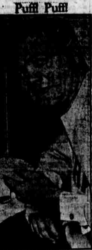
Puff! Puff! goes Babe Ruth. No he's not puffing around the bases or a home-run cloud, but powder puff in his vanedville.

A perfumed grapefruit has been produced in Florida.