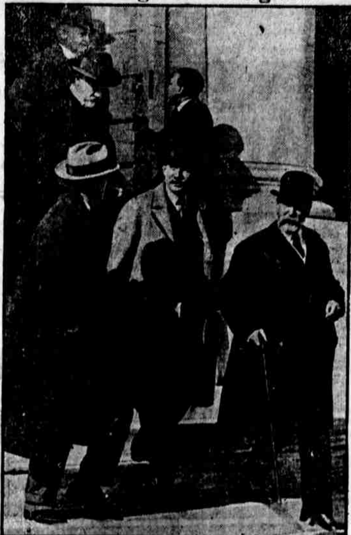
American delegates to the Arms Conference leaving Continental Hall, the scene of the conference. In front are Secretary of State Hughes (right) and Ellihu Root. Behind Root is Senator Lodge. Just back of Lodge is Senator Underwood.