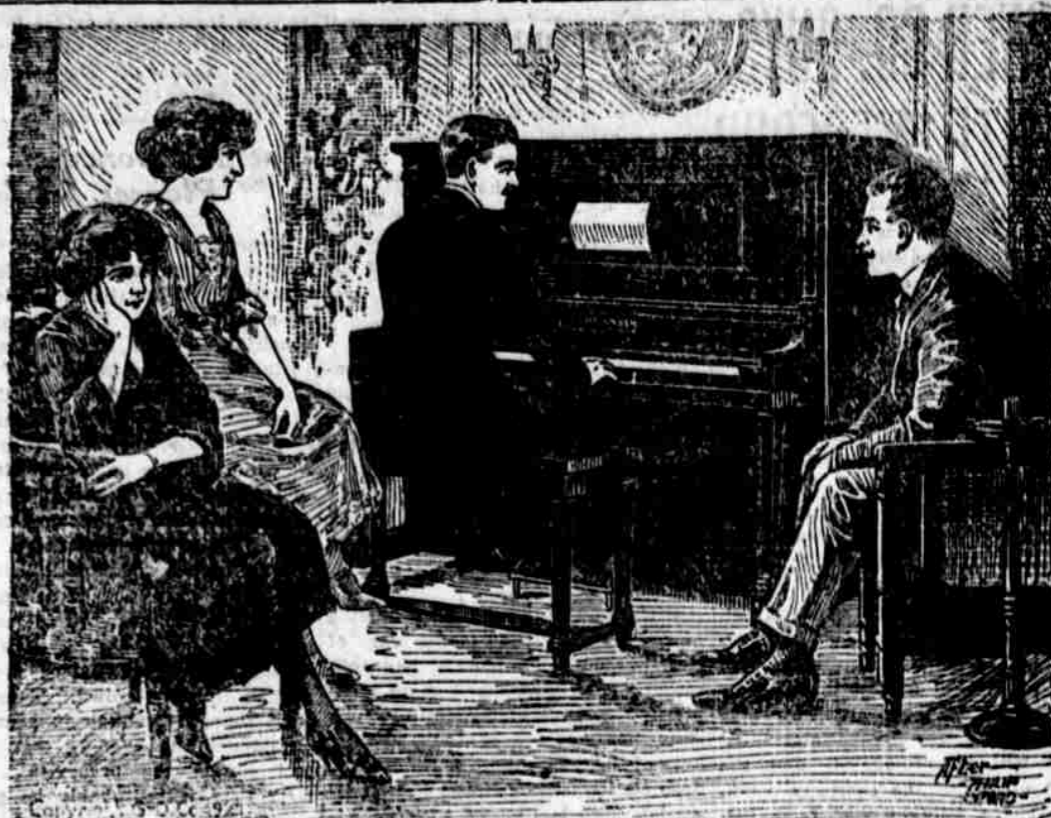
"Jack, you don't look like much of a musician but you certainly can make that player-piano sing." "You're behind the times, Frank. A fellow doesn't need long hair to play a Gulbransen well. Learned it in a couple of weeks."