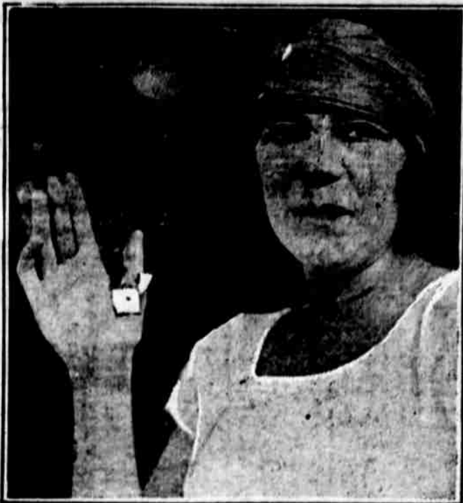
Here's the hand that wielded the racket that won the European tennis championship for Suzanne Lenglen. Notice that her only preparation for a match is a piece of tape at the base of the thumb to prevent blisters. Also notice how the outdoor game has "weather-beaten" her face.