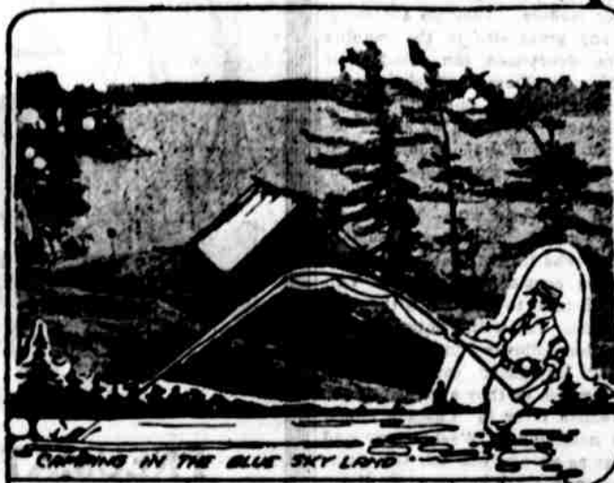
CAMPING IN THE BLUE SKY LANDS