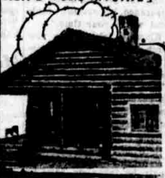
UPPER—A camp by the lake shore under the blue sky, LEFT; Something for supper, RIGHT. LOWER—Boating is fine on the smooth surface of the Williamson, LEFT; A cozy summer cabin RIGHT.