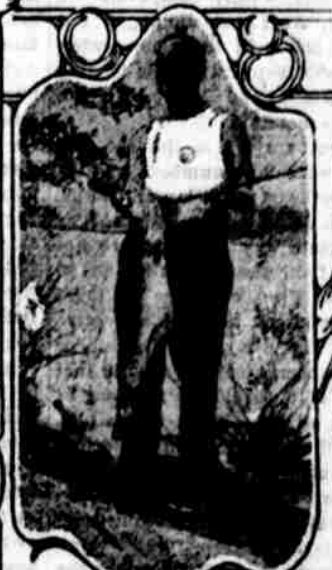
HERE'S YOUR SUPPER! HOW'S YOUR APPETITE?