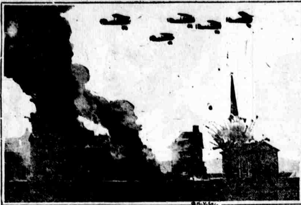
This "village" was constructed in England for a demonstration of the advances made in aerial warfare. Most of the buildings were made of spare airplane parts. The church steeple is 40 feet high. All of the pilots who took part in the bombing were veterans of the World War. When they finished—ashes!

in their car. They will spend a month camping in Wood river valley.