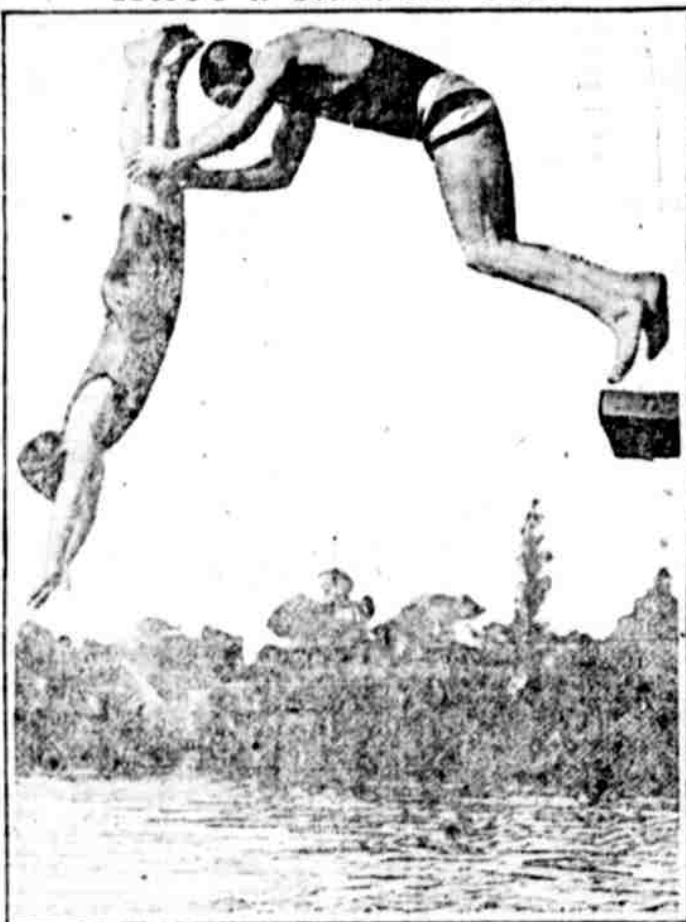
Don't try it unless you're a good diver. It's a double dive executed by amateur divers at Highgate, England. By the time they hit the water their bodies will be straightened out in a line.