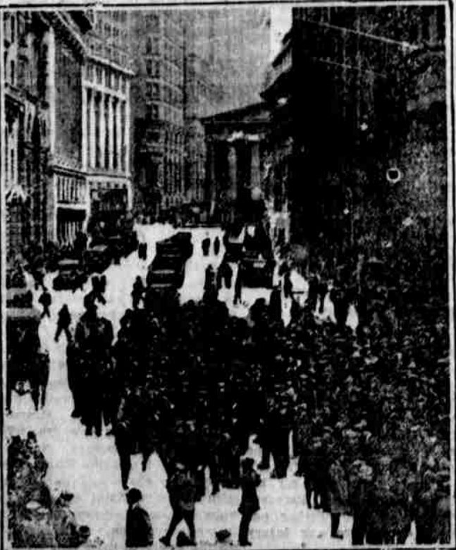
The curb market on Broad Street, New York, will be no more after July 10. The curb brokers' association will move into its new building there.