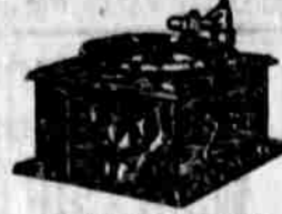
VICTROLA IV $25