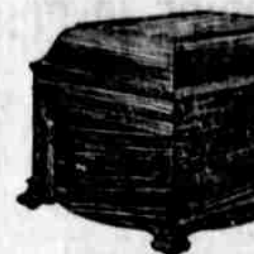
VICTROLA VIII $50

During the dusk hour of the quiet summer evenings is one of the times you really appreciate a Victrola and a few good records.