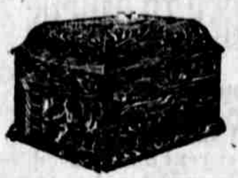
VICTROLA IX $75