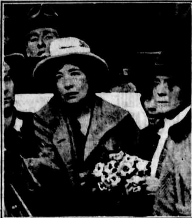
Many friends greeted Sylvia Pankhurst when she was released from Holloway Jail, London. She served five months as a result of writings that appeared in her Communist paper, "Workers' Dreadnought."