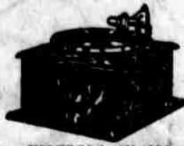
VICTROLA IV $25