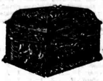
VICTROLA IX $75