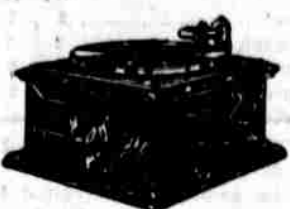
VICTROLA VI $35

During the dusk hour of the quiet summer evenings is one of the times you really appreciate a Victrola and a few good records. Summer Vacation Models are $25, $35, $45, $50 and $75 on terms as low as $5 per month. Full value allowed on exchange for large cabinet sizes anytime within six months. For "Just a Song at Twilight" you need that Victrola now.