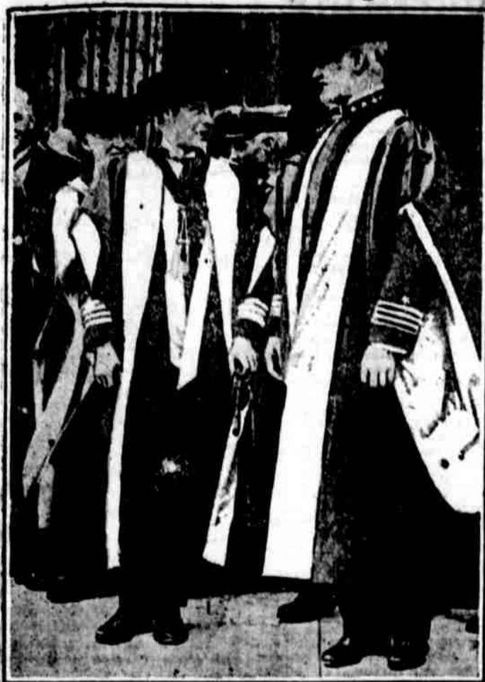
Admiral Sims, whose London speech on the Irish question caused Secretary Denby to order him home, went to England to receive an honorary degree from Cambridge University. Picture shows him and the Prince of Wales in the robes of Doctor of Law on the university steps.