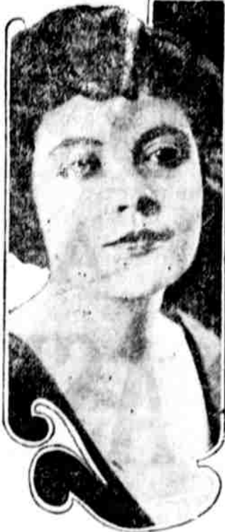
Lois Wilson is leading woman in "The Lost Romance," Edward Knoblock's play which proves love needs change and excitement to endure.