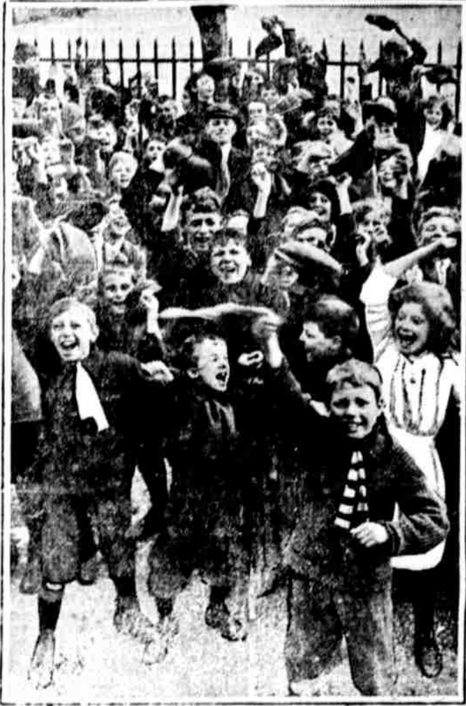
They're firitish kids of Coryden School. No, the school term isn't

The First Application Makes Skin Cool and Comfortable,