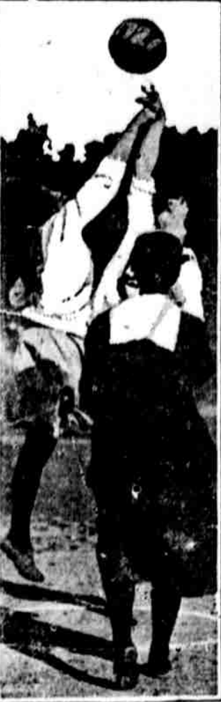
The girl on the right has "won the jump" back to the camera is the referee who has just sounded her whistle for the start of the first spring basketball game at Bryn Mawr college.