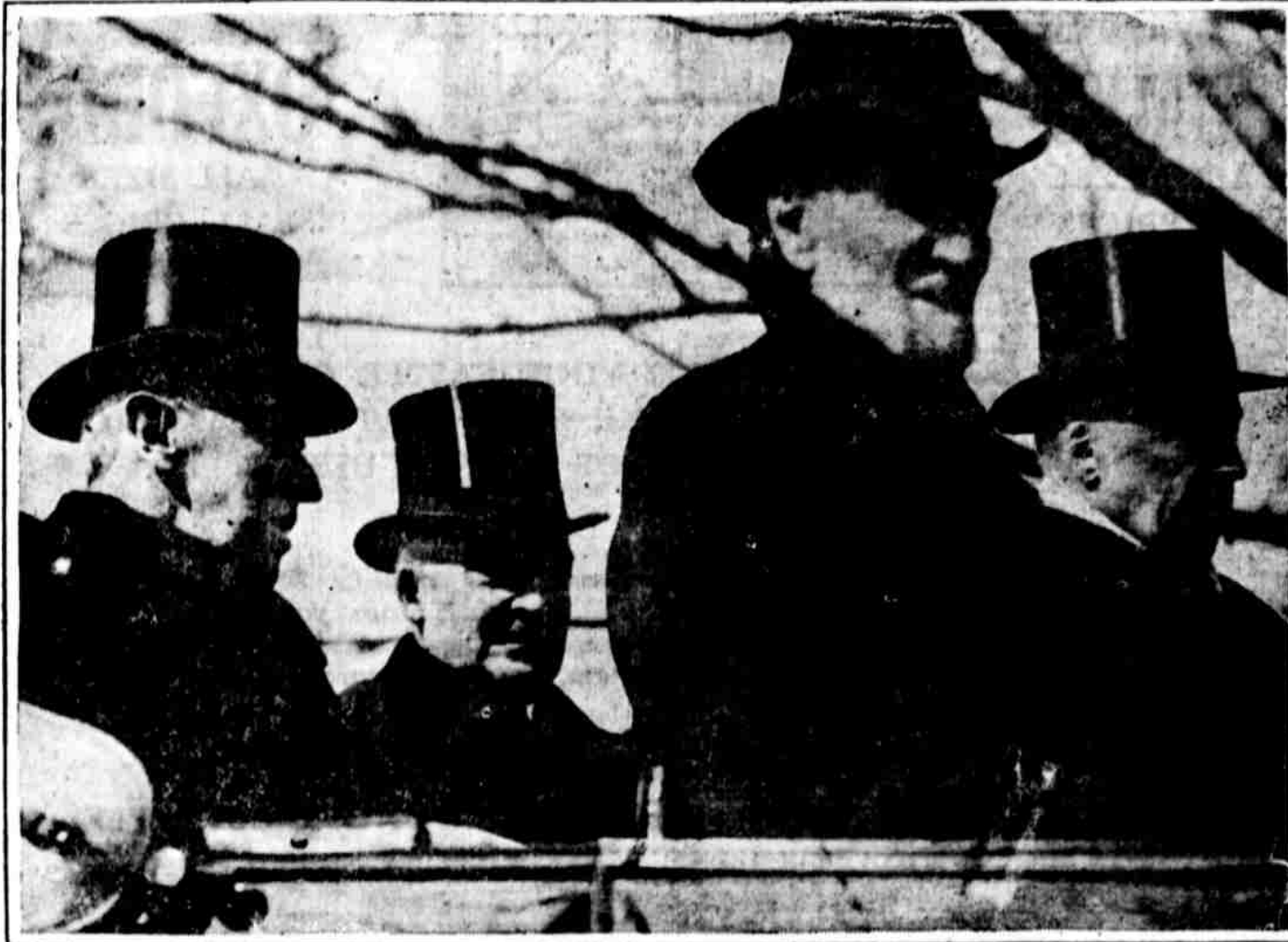
HARDING AND WILSON ON WAY TO INAUGURATION

This picture shows President Wilson and President-elect Harding on their way from the White House to the capitol, where Wilson transacted the closing business of his second term as president and Harding was inaugurated as his successor. With Wilson and Harding rode Congressman Cannon and (at the extreme right of the picture) Senator Knox.