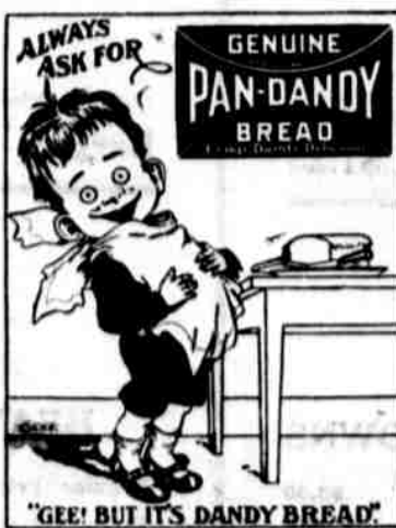
"GEE! BUT IT'S DANDY BREAD"