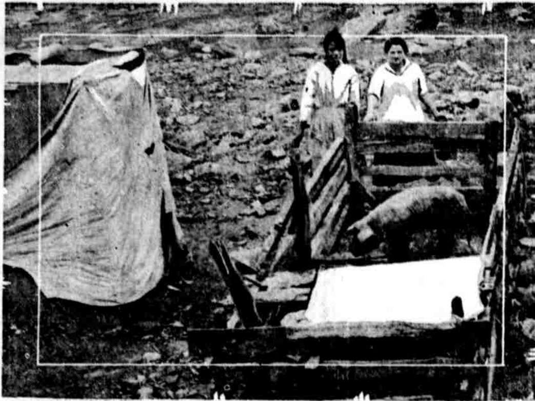
WILLIAMSON, W. Va., Dec. 28.—How the striking West Virginia miners are facing the severe cold weather is shown by this picture of a typical striker's home and his winter meat supply. This particular miner is more fortunate than most of the strikers—few have pigs. On the left is his shack, made partly of boards, partly of tenting, little bigger than the pig pen. The strikers' right to unionize is fully supported by the Miners' National union, which is sending supplies.