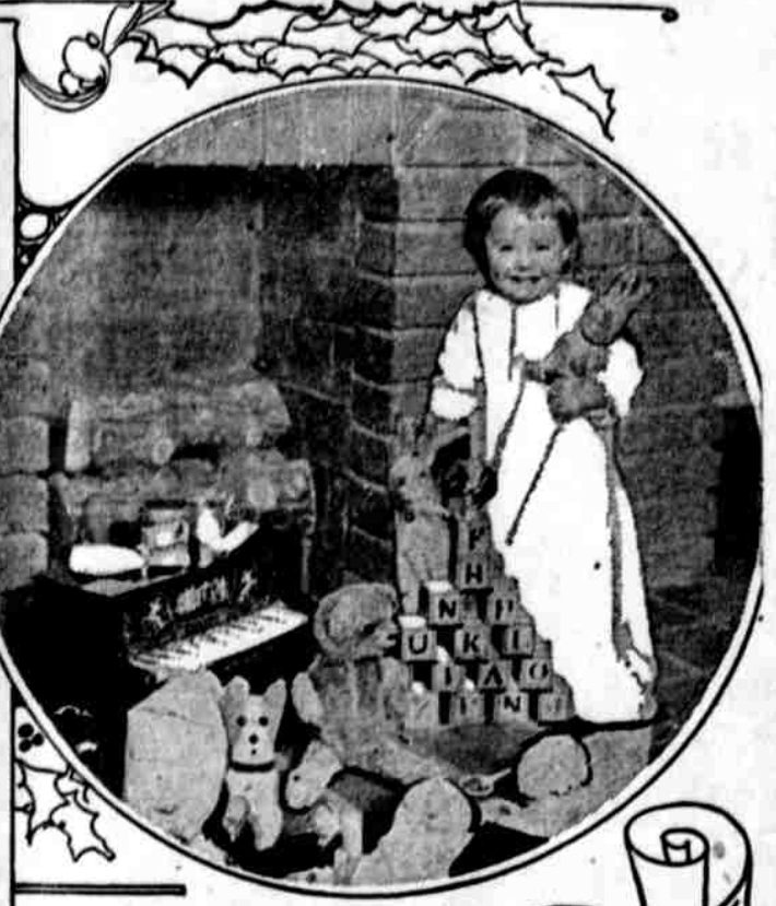
Say, wasn't Santa good to me. He didn't make a sound. But he came down the chimney. Lookit all the things I found.