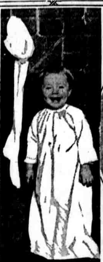
I didn't hang my stocking up. It isn't big enough. I took my mamma's great big one. 'Twill hold jes' heaps of stuff.