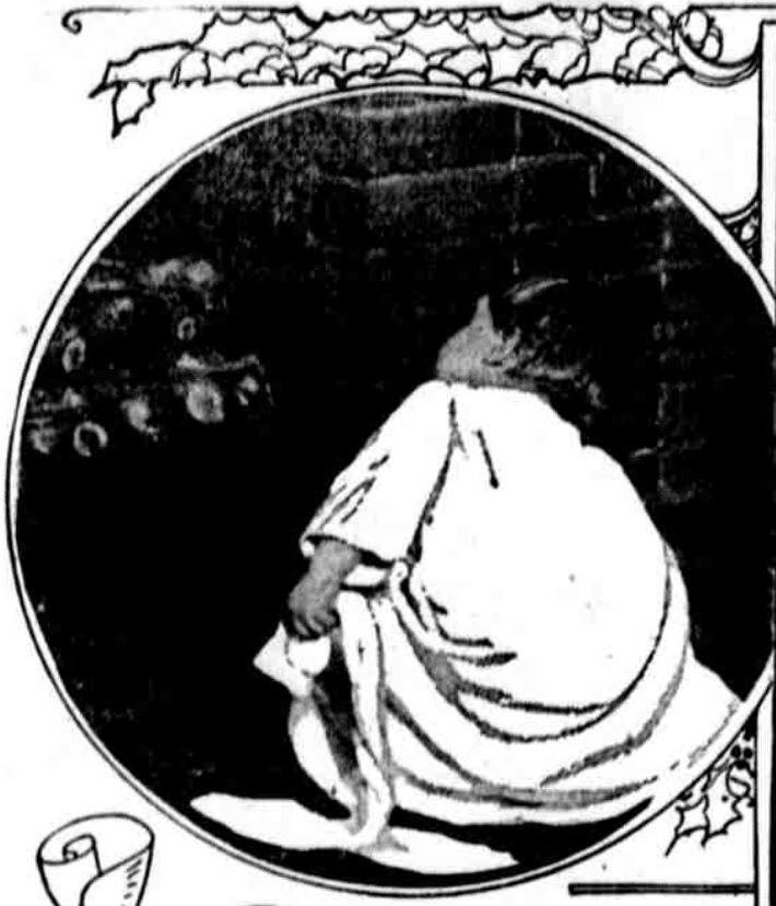
I wonder how fat Santa's gonna crawl down frum that place. I'd think he'd spill his whiskers and get black stuff on his face.