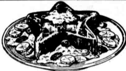
Made with Style-II Mold