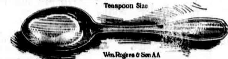
Wm. Rogers & Son AA

19 Flavors in Glass Vials Strawberry Raspberry Loganberry Pineapple Cherry Orange Lime Mint Lemon Coffee Flavor A bottle in each package