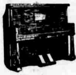
$750 to $1100