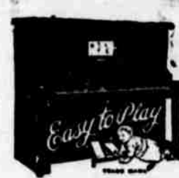
$595.00 to $750.00