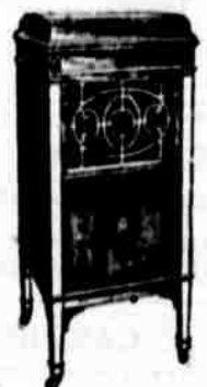
New Edison Like new, $140.00