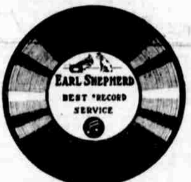
6,000 in Stock