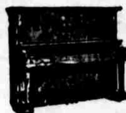
Used, $195.00 up