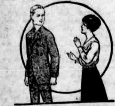
YOUR NEW SUIT

Takes the kinks out of sore muscles. Keeps the skin healthy. Genuine electric massage vibrator complete $5.00