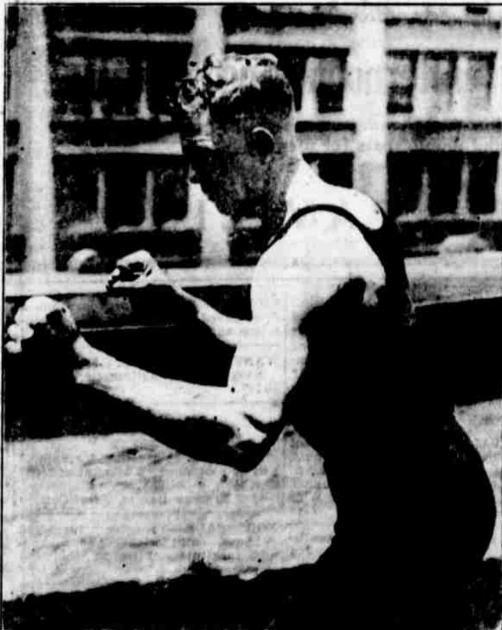
WILD BILL REED