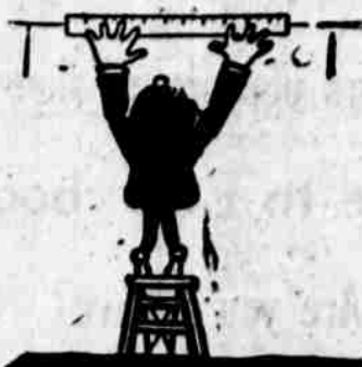
Up to Measure.

You Know What "Up-to-Measure" Means Don't You?