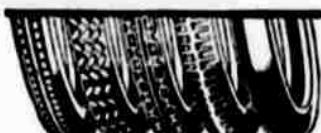
ROYAL CORD - ROBBY-CHAIN-USCO-PLAIN

For best results—everywhere—U. S. Royal Cords.