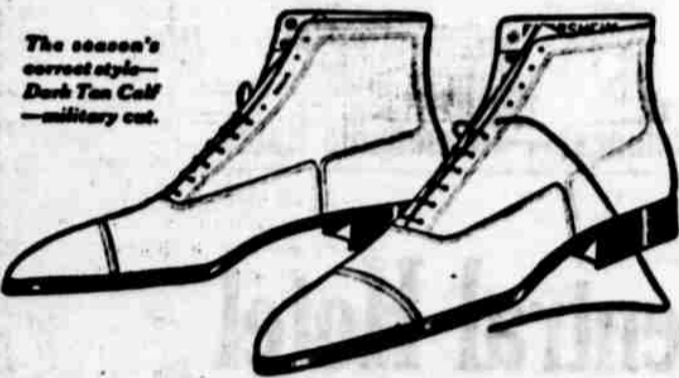
The season's correct style—Dark Tan Calf—military cut.