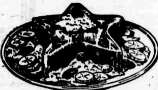
Star Shaped Mold—Style—11