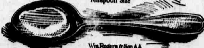
Wm. Rogers & Son AA

An aluminum half-pint cup. Fill twice with boiling water, as per directions, to dissolve one package Jiffy-Jell. Use as a standard cup in any recipe. Send two trade-marks for the Jiffy-Cup.