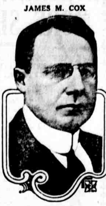
JAMES M. COX