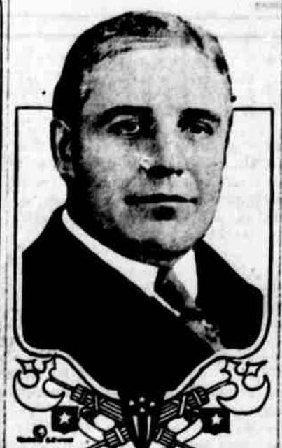
vania, who is favored by Senator o tirely passed. sound choice for the Republican presidential nomination