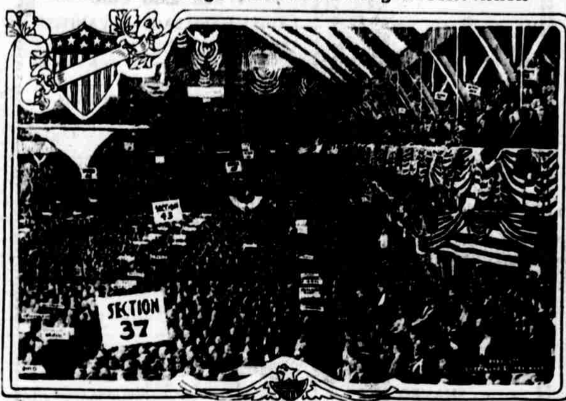
This view of a part of the interior of the Chicago Conseum was taken during the Republican national conven-

the tentative planks relating to the JOHNSON ANALYZES CHICAGO June 10 .- Portions of peace reservation, Mexico and Armenta follow: